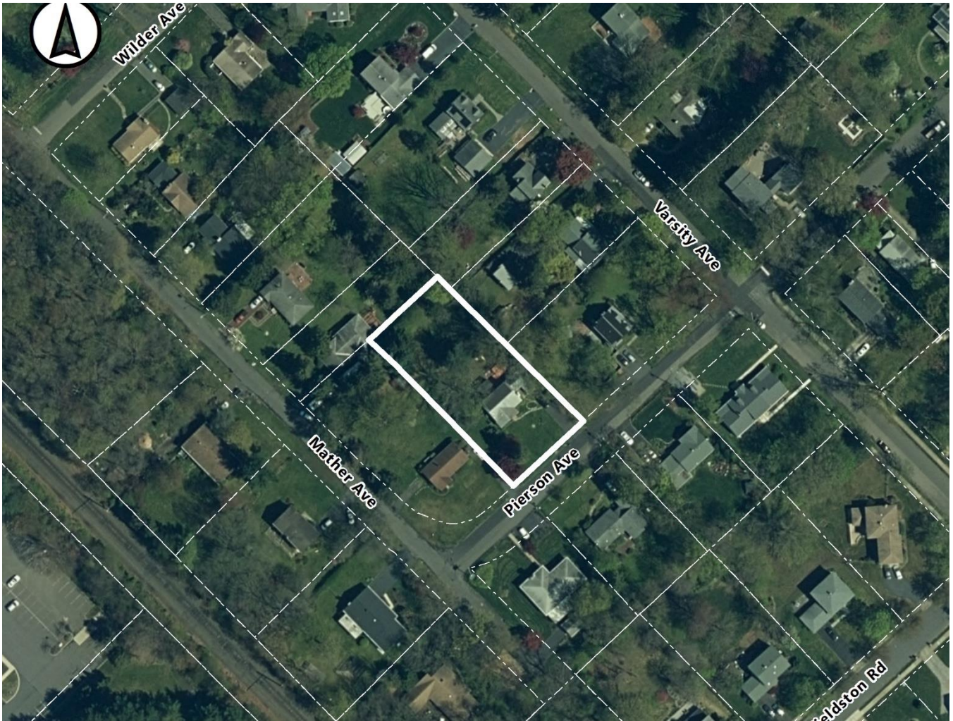
Map 1: Aerial of Subject Site (scale: 1" = 150')