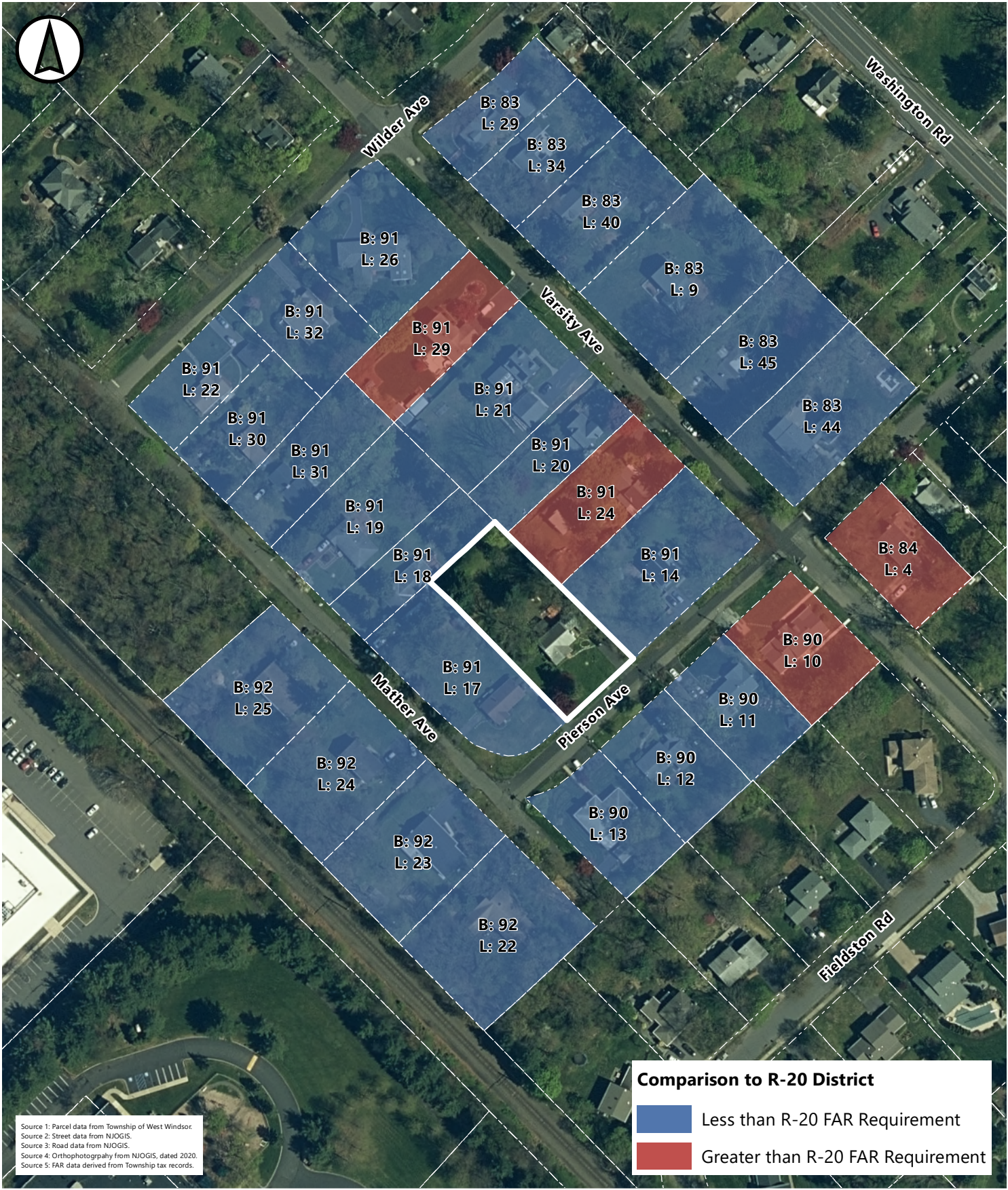
Dwg Title FAR Map 1: Comparison to R-20 FAR Requirement