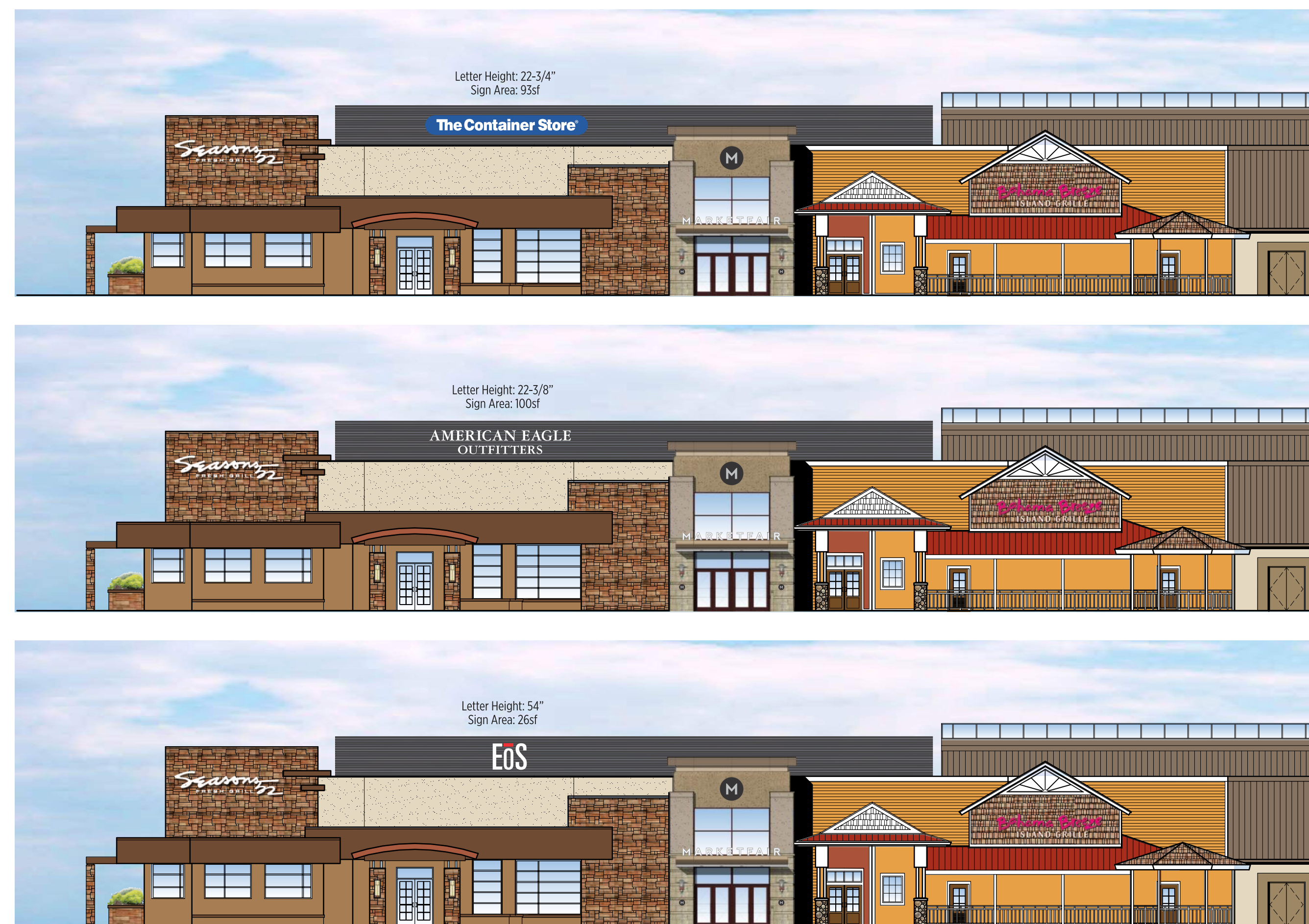
Scale: 1/16" 1'-0"