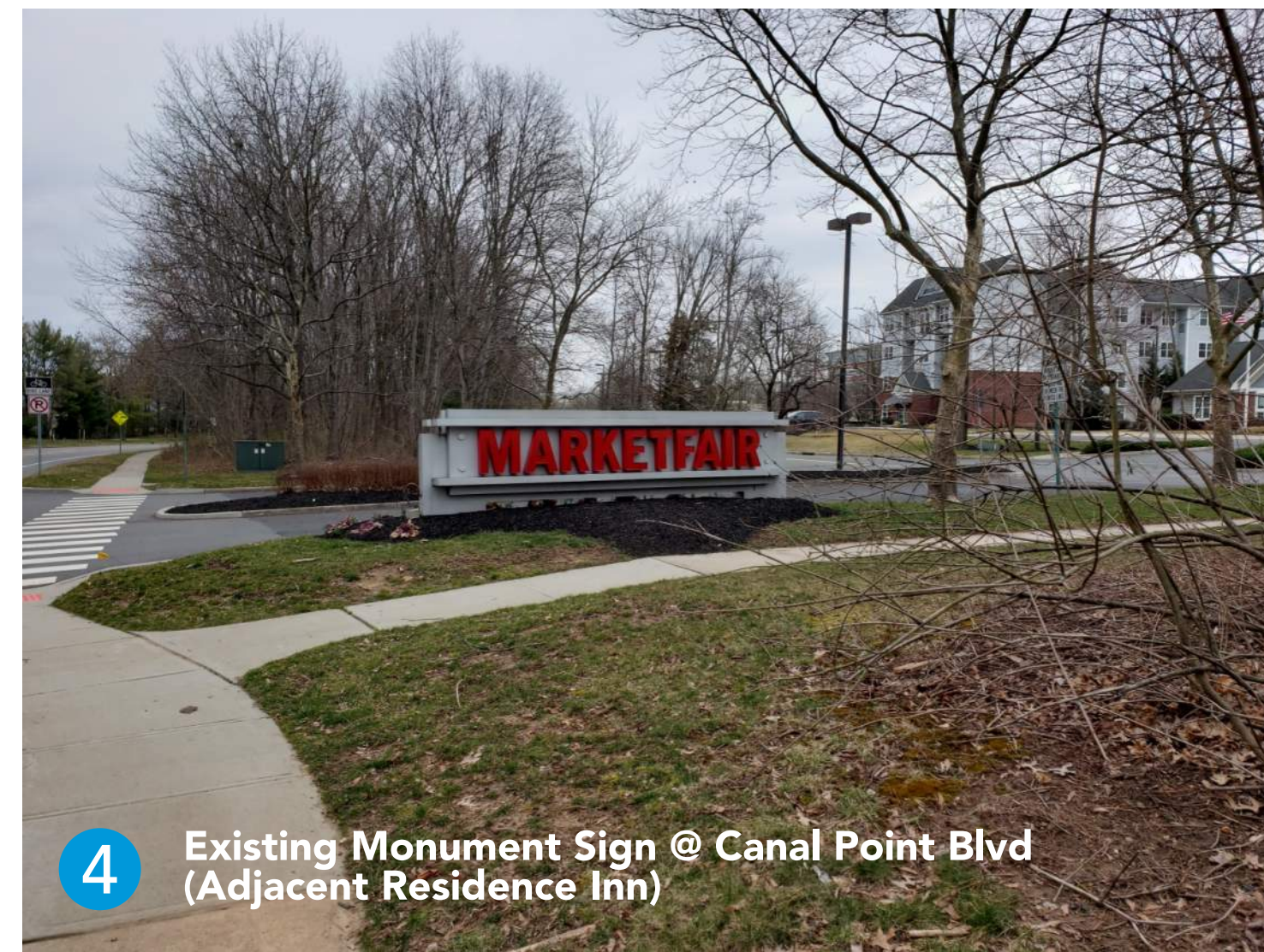
4 Existing Monument Sign @ Canal Point Blvd (Adjacent Residence Inn)