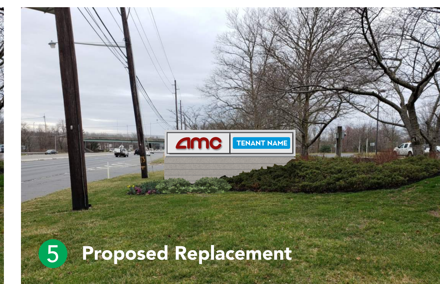
5 Proposed Replacement