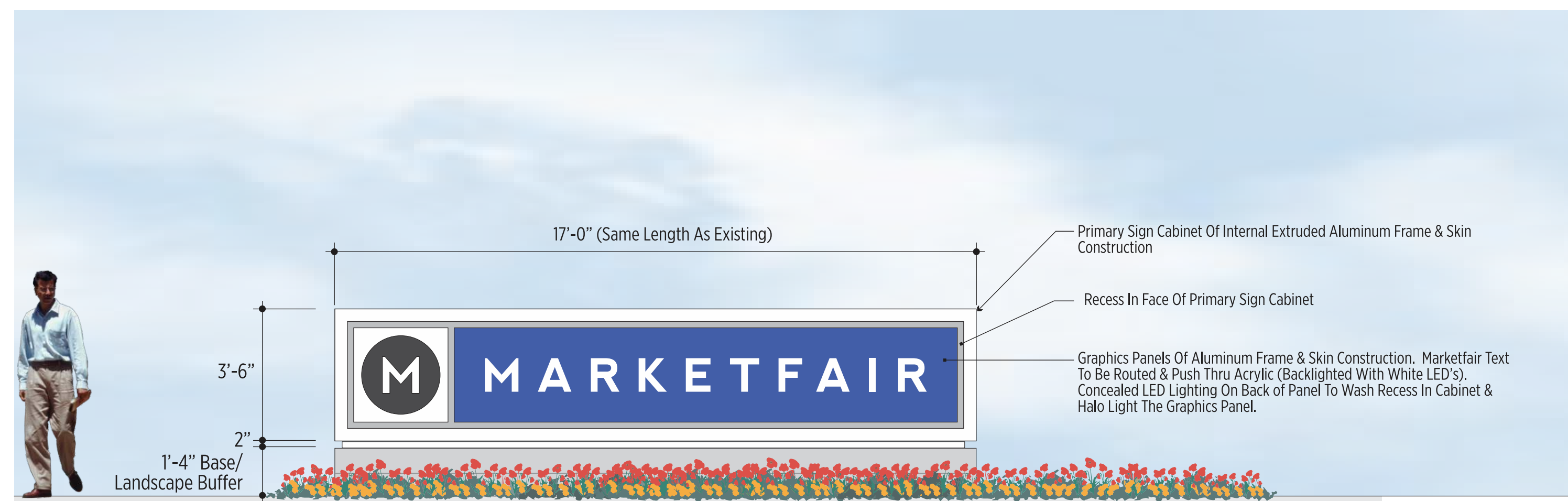
3 4 Proposed Replacement Monument Sign Elevation (Opposite Side Is Similar) (Internally Illuminated) Scale: 3/8" = 1'-0"