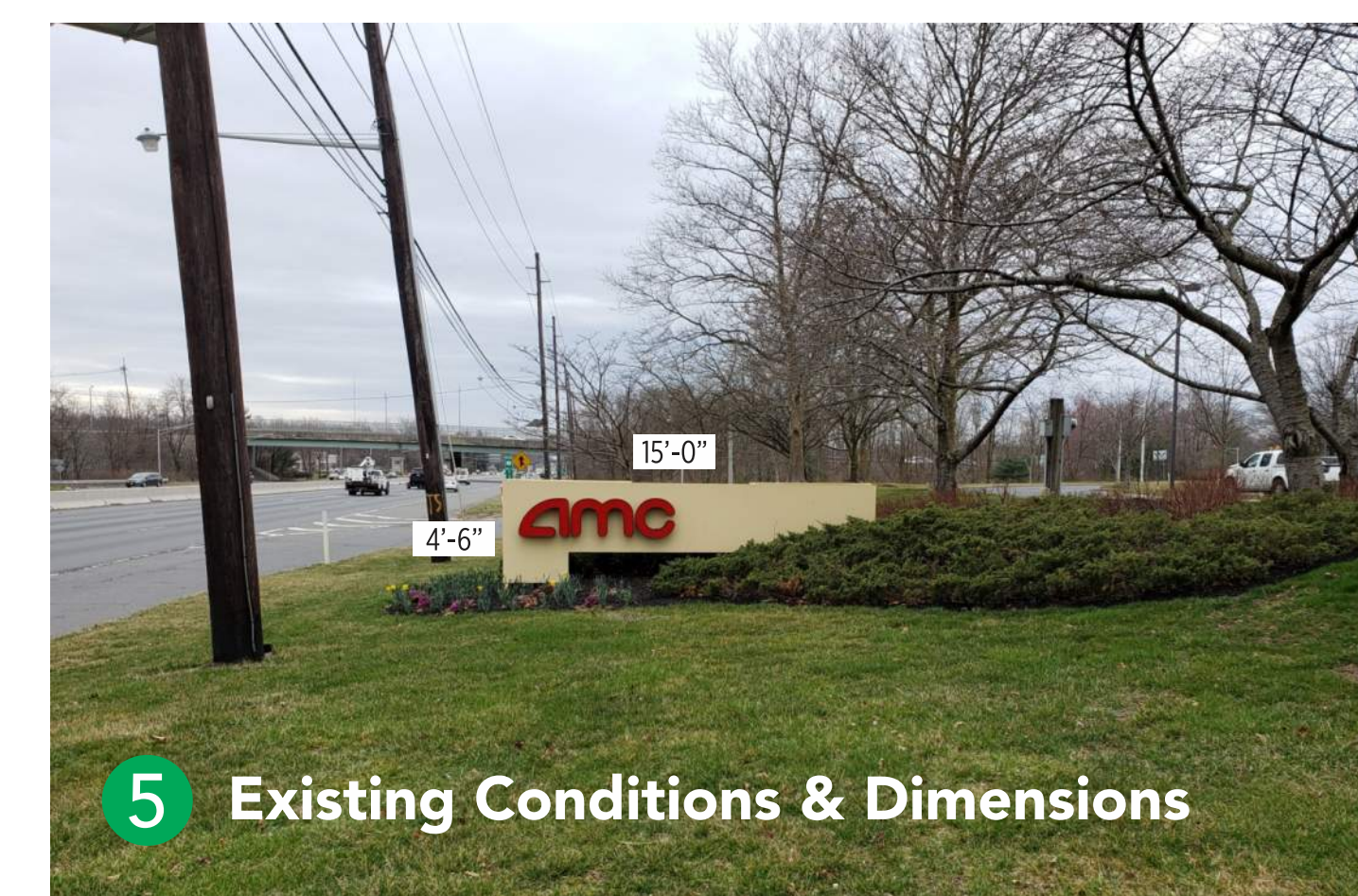
5 Existing Conditions & Dimensions