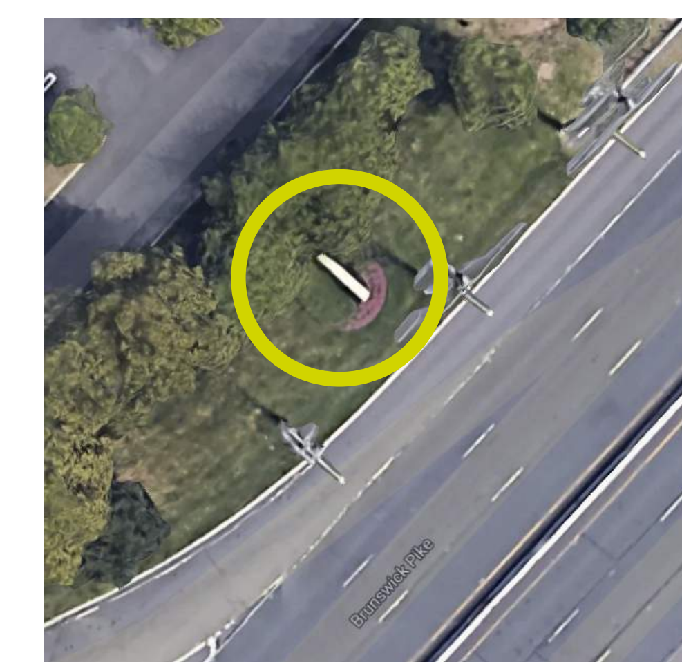
Aerial Photo (Existing)

All Designs/Sizes Subject To Review & Approval By Local Zoning