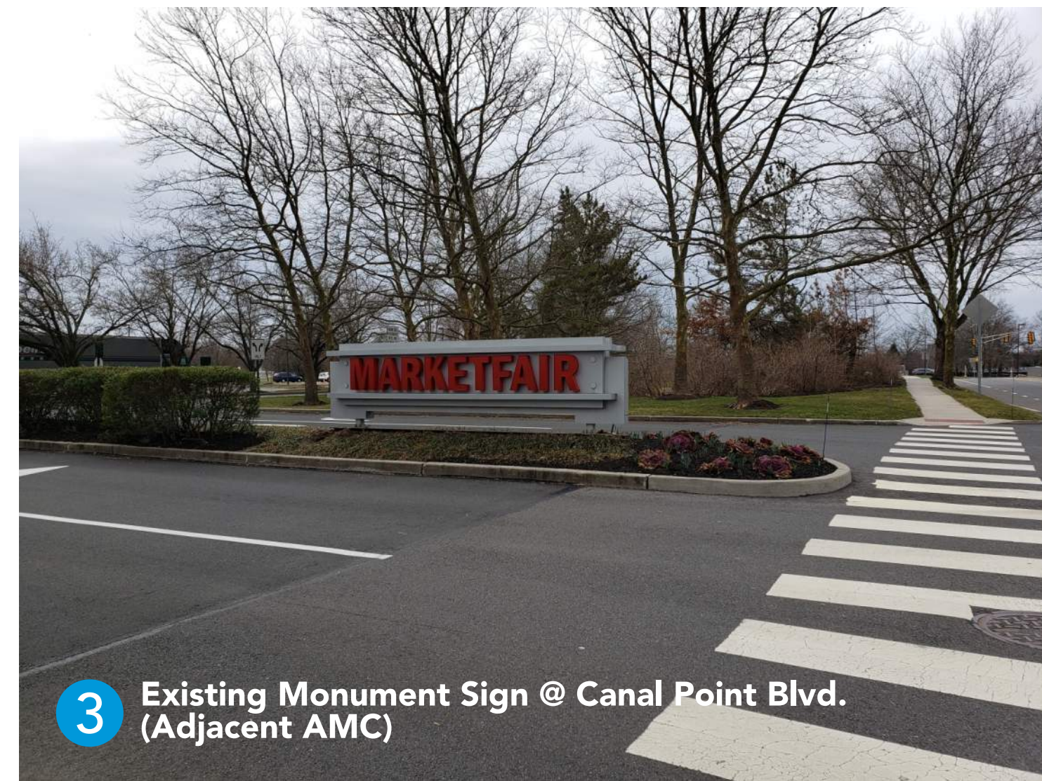
3 Existing Monument Sign @ Canal Point Blvd. (Adjacent AMC)