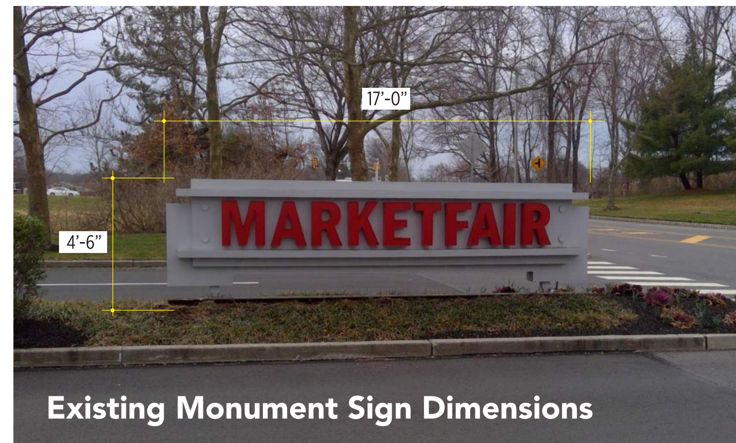
Existing Monument Sign Dimensions